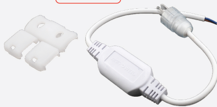
2835-180leds/m 220V LED Strip Light